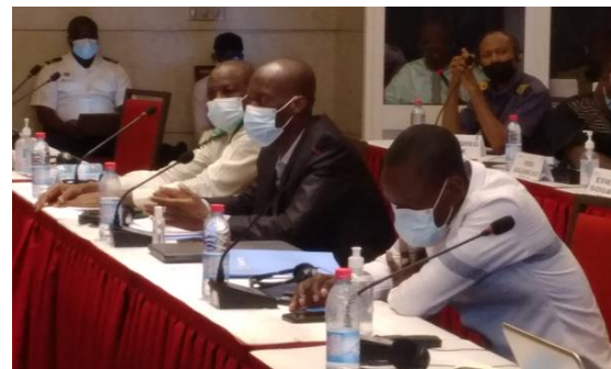
Right-above: A cross section of participants

A field visit was also organised to the Port Autonome de Cotonou where participants received briefings on the general operations of the port. The briefing highlighted the various security measures at the port and how the port coordinates with other agencies.