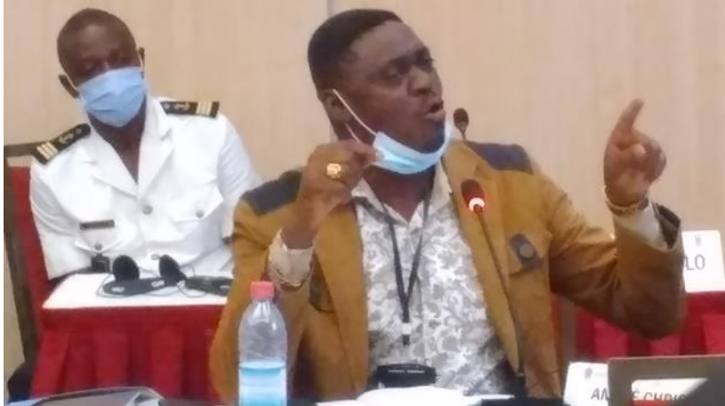
Left: A participant making an intervention

Unreported and Unregulated (IUU) among others and their linkages to other forms of transnational organised crimes. It also raised participants' awareness on the need to strengthen intra and inter-agency collaboration and the importance of leveraging the roles of private/non-state actors such as coastal communities, private shipping lines, research institutions etc. in ensuring a safer and secure maritime domain.