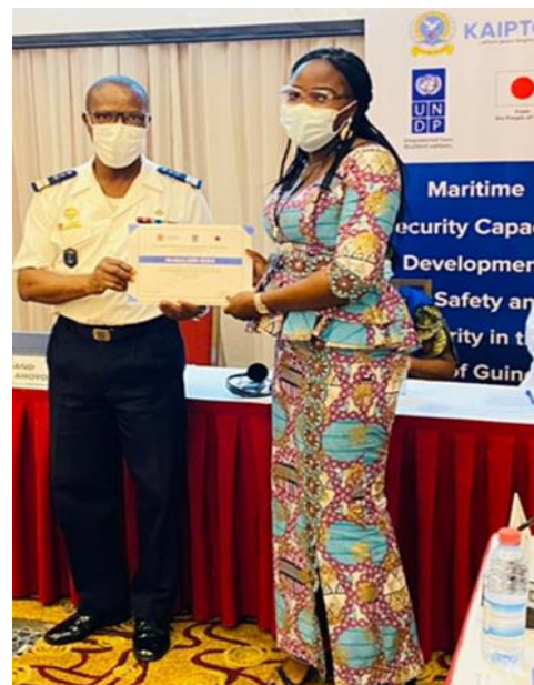
Participants receiving certificates of participation