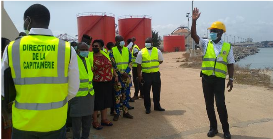
Participants receive briefing from an Officer at the Port Autonome de Cotonou

The final crust of the course was a panel session which empanelled a local expert to give insights on the impact of the COVID-19 pandemic on maritime security operations. An officer from the Ghana Embassy was also invited to present the diplomatic processes, procedures and negotiations involved in arrests and prosecutions of maritime crimes and offense which are transnational in nature.