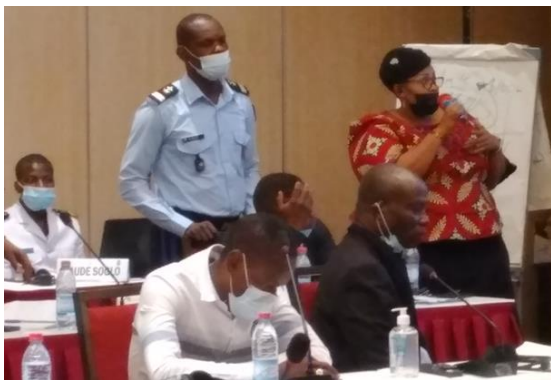
Left-above: Participants making presentations

The course also offered an opportunity to participants to deepen their knowledge on the emerging national legal framework which allows for the prosecution of various maritime crimes in a specialized court. It also drew attention to the peculiar maritime crimes confronting the country and how this emerging framework could help address some of the current obstacles to effective prosecutions of maritime crimes. It was also an opportunity for participants to network and interact with actors from other agencies.